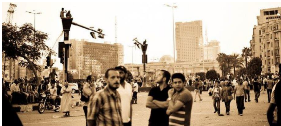
Cairo-Tahrir, July, 2011