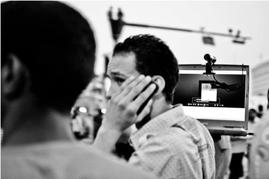
Cairo-Tahrir, July, 2011