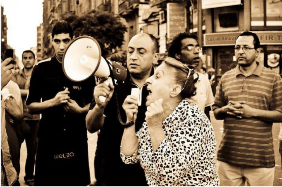
Cairo - Tahrir, July, 2011