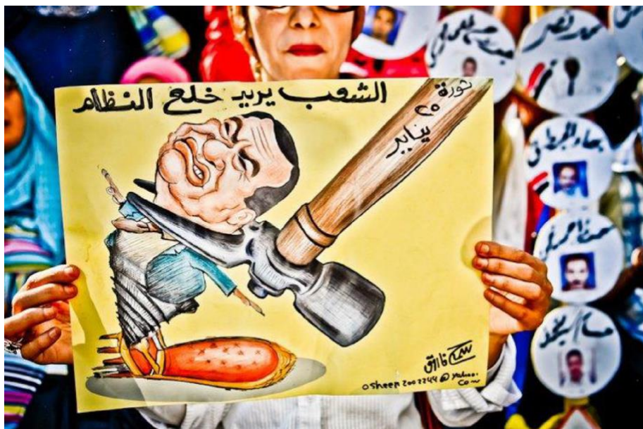
Cairo-Tahrir, "The people want the removal of the system," July, 2011