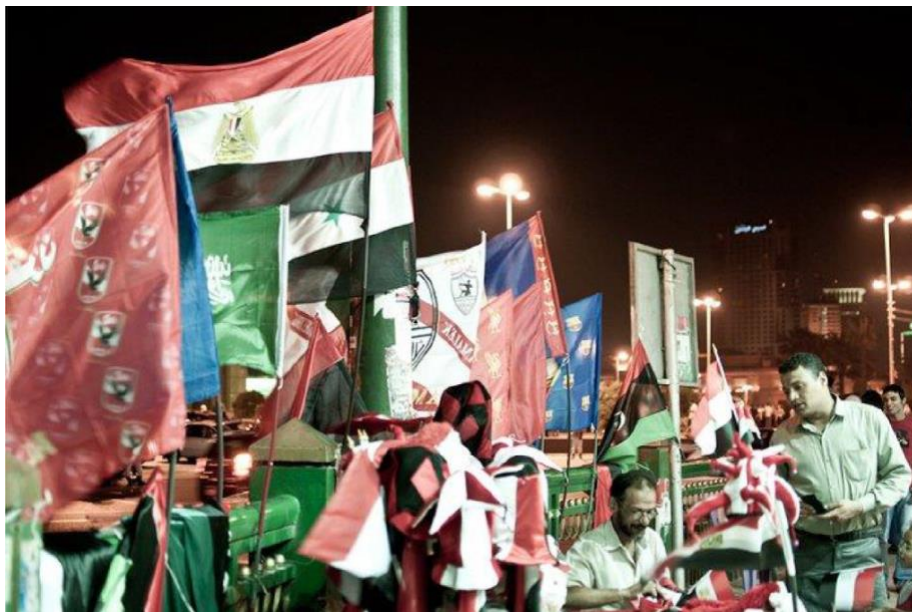
Cairo, June, 2011