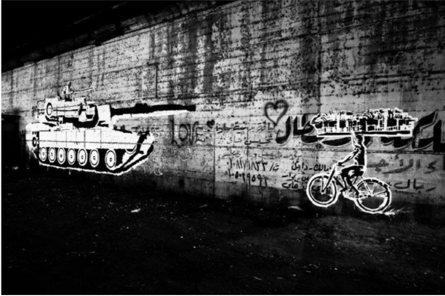
Cairo-Zamalek, July, 2011