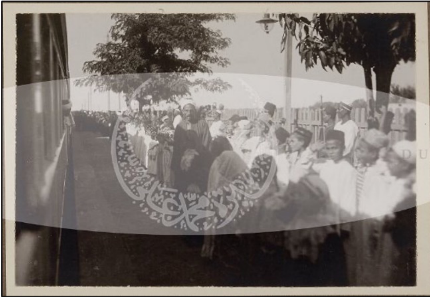
Figure 3: Khedive 'Abbas Hilmi II attending events at Alexandria, 1910s.

This approach to students' performances was not confined to Egyptian authorities. While the specific reasons for organizing official school visits and showing off academic excellence varied based on the priorities of different authorities—such as the securing of funds for the school by means of inviting prominent local and foreign personalities—the underlying interest in children and students as a source of pride for society and the nation was a remarkably common factor across local and foreign communities. Moreover, the use of school examinations, prize ceremonies, and recitals to promote political interests was by no means limited to Egypt in this period. 54